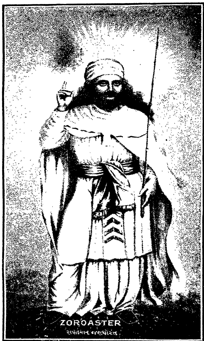
Zoroaster Old Master