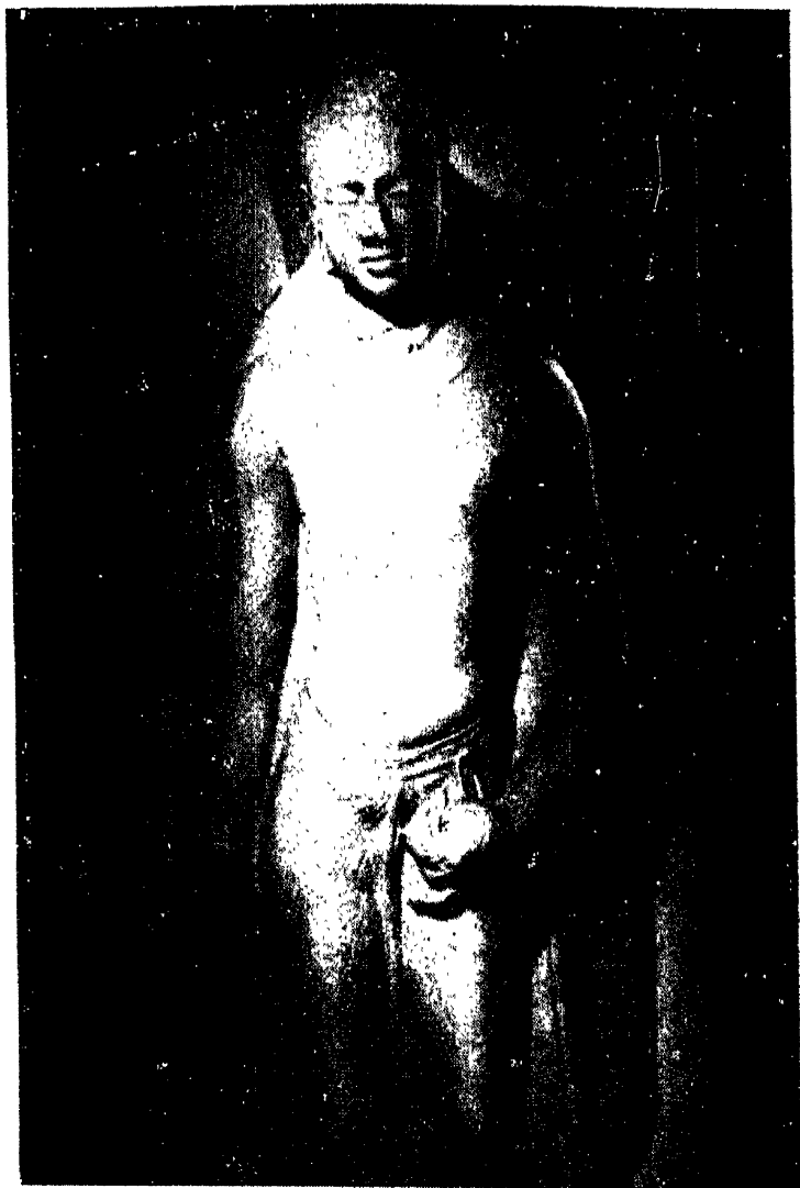
Gautama Buddha Old Master