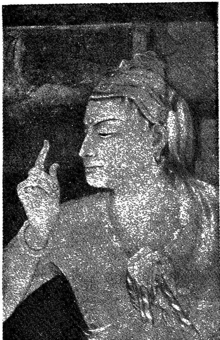
Sri Krishna Sri Nandalal Bose