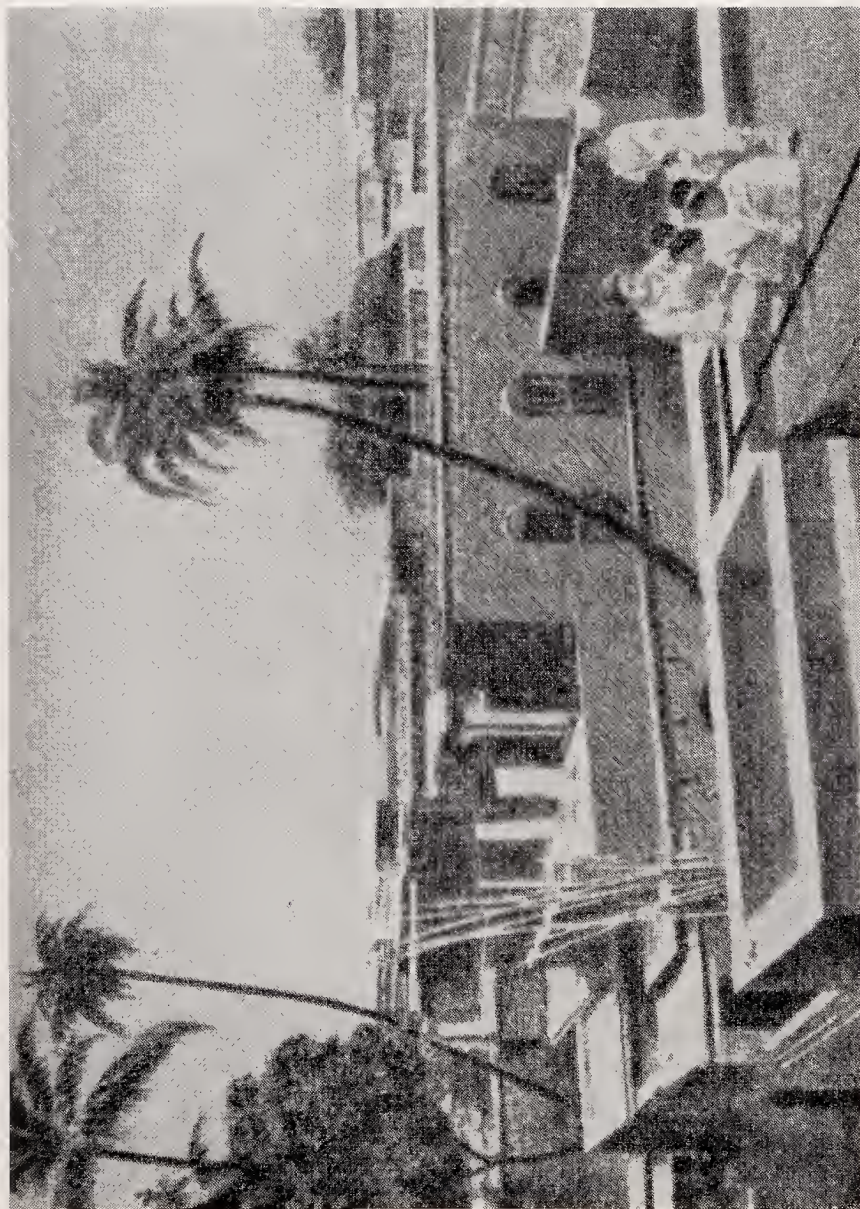
On The Terrace