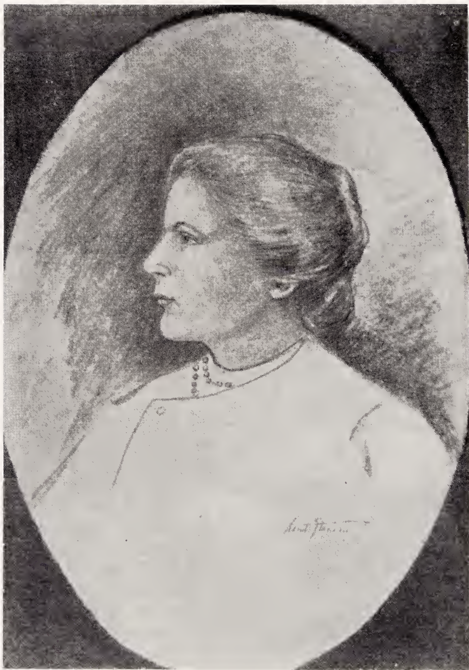
A Pencil Sketch of Sister Nivedita