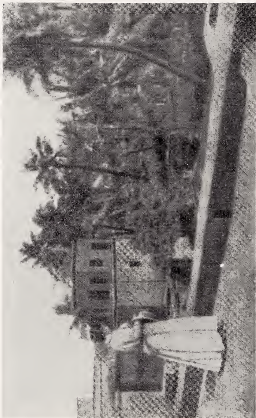
On The Roof