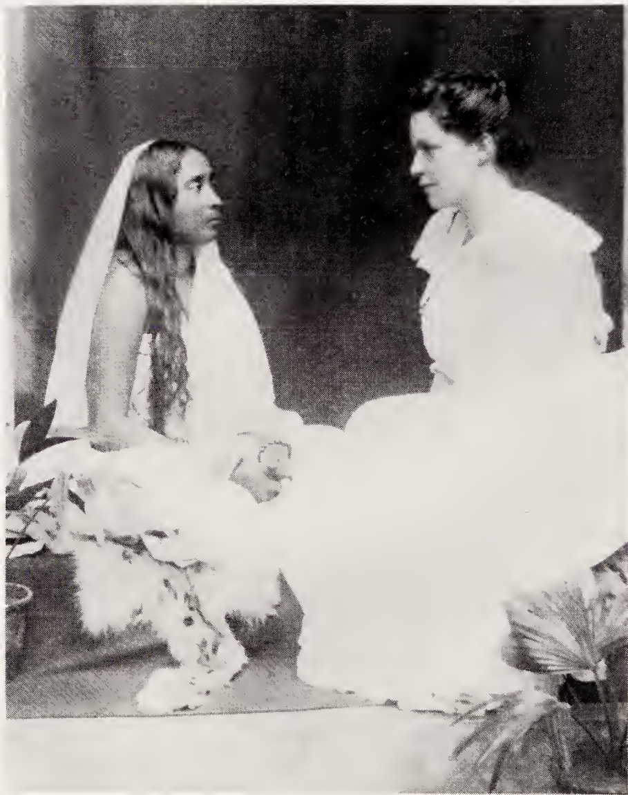
Sister Nivedita with Holy Mother Sarada Devi