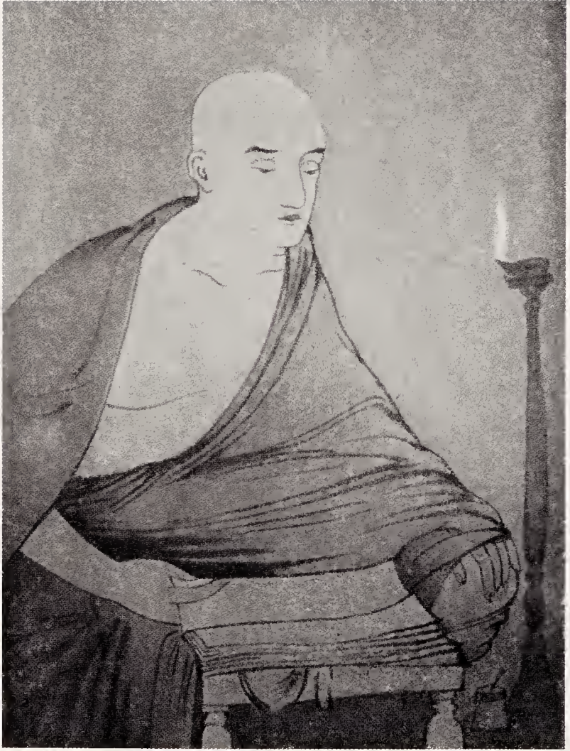
The Indian Story-teller at Nightfall