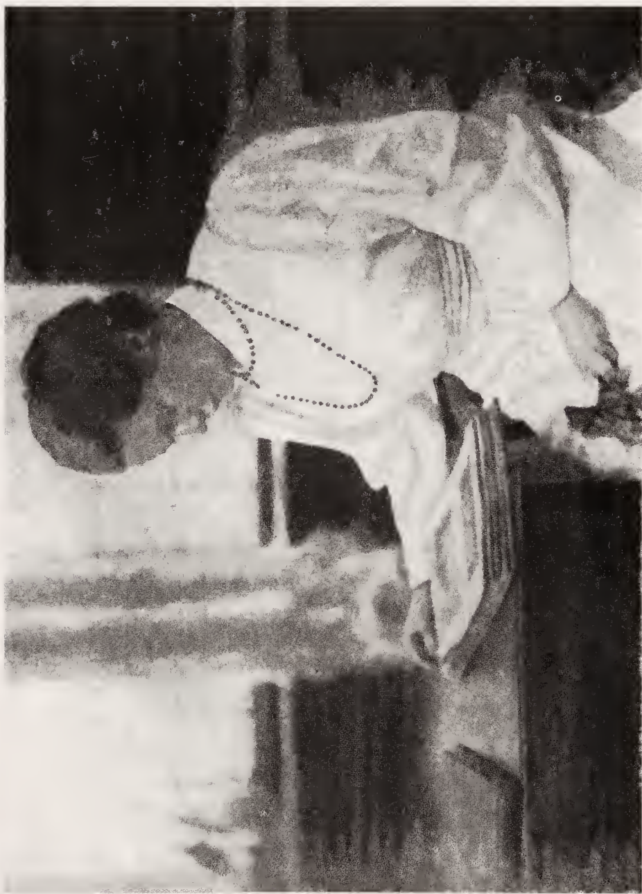
Sister Nivedita in Her Study