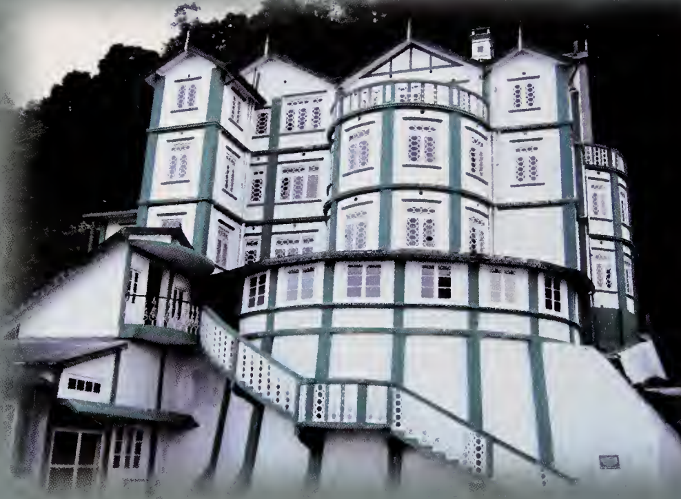
Roy Villa, Darjeeling, India. Sister Nivedita breathed her last here.