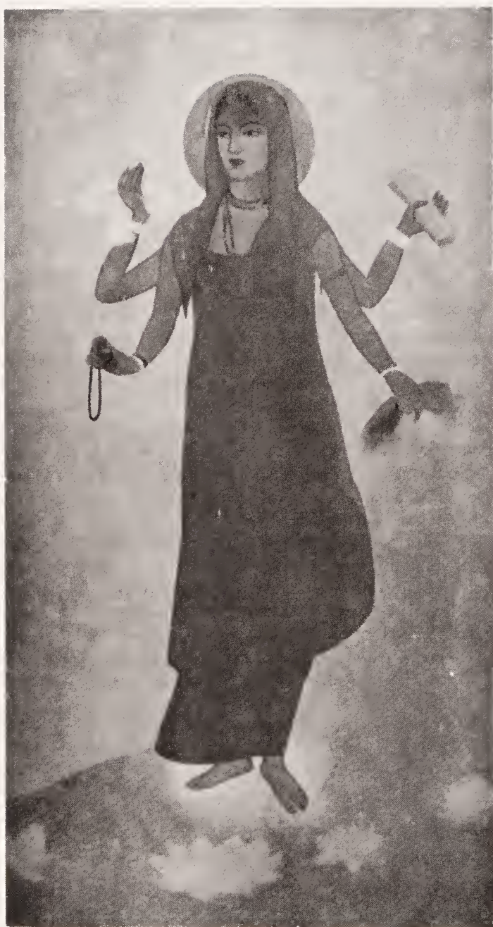
Bharatmata by Abanindranath Tagore