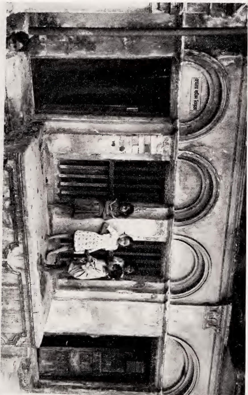
House of Sister Nivedita at 16 Bosepara Lane, Kolkata