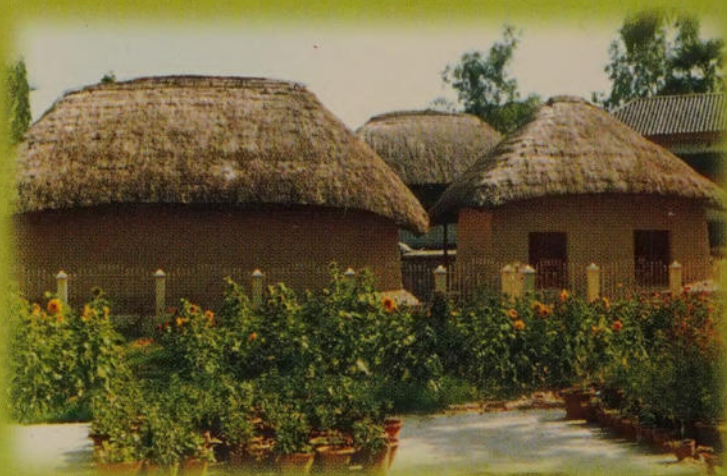
Mother's House, Jayrambati

“The Holy Mother is a living presence and he who really seeks her, will surely find her.”